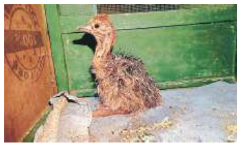
One of the ostrich chicks at the zoo, Rajkot Municipal Corporation