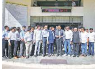
Builders t the Ahmedabad collectorate on Friday.

On February 4, the Gujarat government announced a 100 per cent increase in jantri or Annual Statement of Rates) which was made effective on an immediate basis. This hike came after a gap of 12 years and it meant that higher stamp and registration charges had to be paid to the state government for any real-estate property purchased from